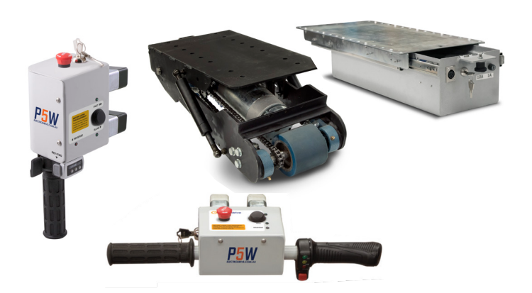
Pictured (from left to right): Hand controller (vertical); Hand controller (horizontal); Non-retractable fifth wheel (drive wheel); Slide-out battery carriage.

The Powered Fifth Wheel (P5W) is a retrofittable solution for converting your manually pushed trolleys into powered ones.